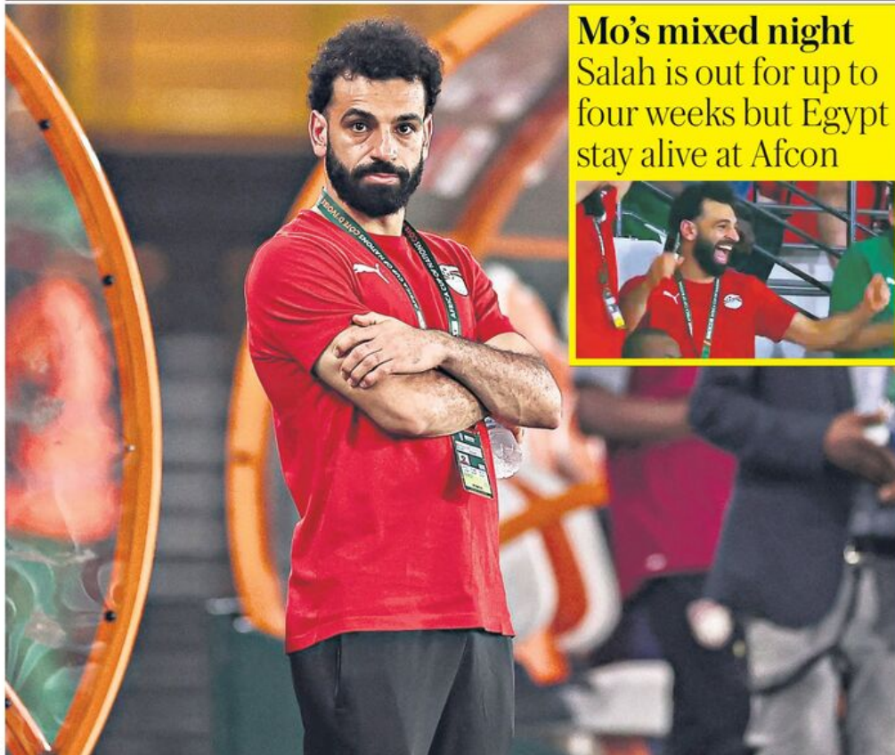
Injured Mohamed Salah watches on during Egypt's dramatic 2-2 draw with Cape Verde and (inset) celebrates qualification from their Africa Cup of Nations group

When the squad for India was unveiled last month, Rob Key, Continued on Page 2